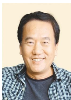
Wang Xiaodong, Ph.D.

◆ Academician of the National Academy of Sciences of the United States, foreign academician of the Chinese Academy of Sciences, director of the Beijing Institute of life sciences, and founder of Baiji Shenzhou (Beijing) Biotechnology Co., Ltd.